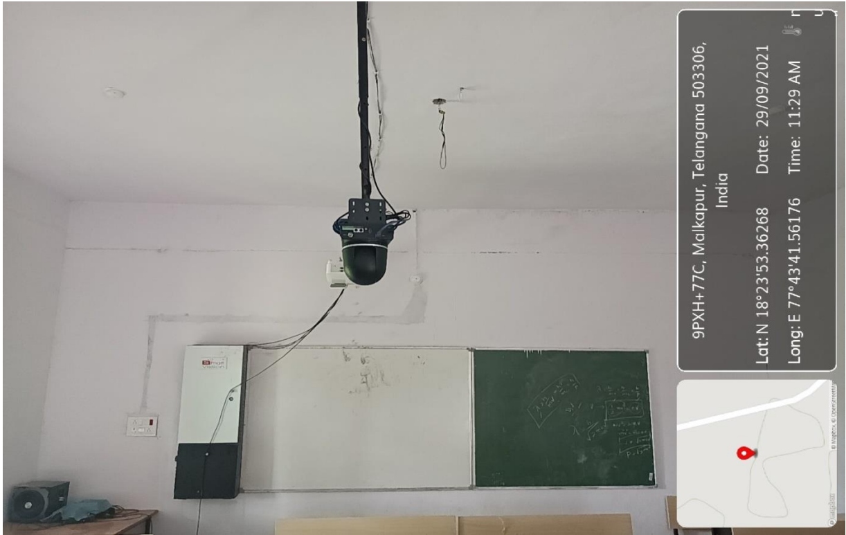
Virtual class room