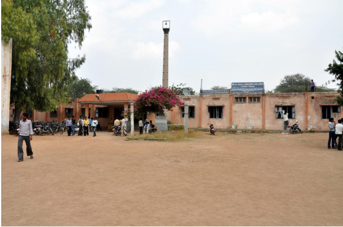
The Main building of the M.A.L.D. Govt. Degree College, Gadwal.