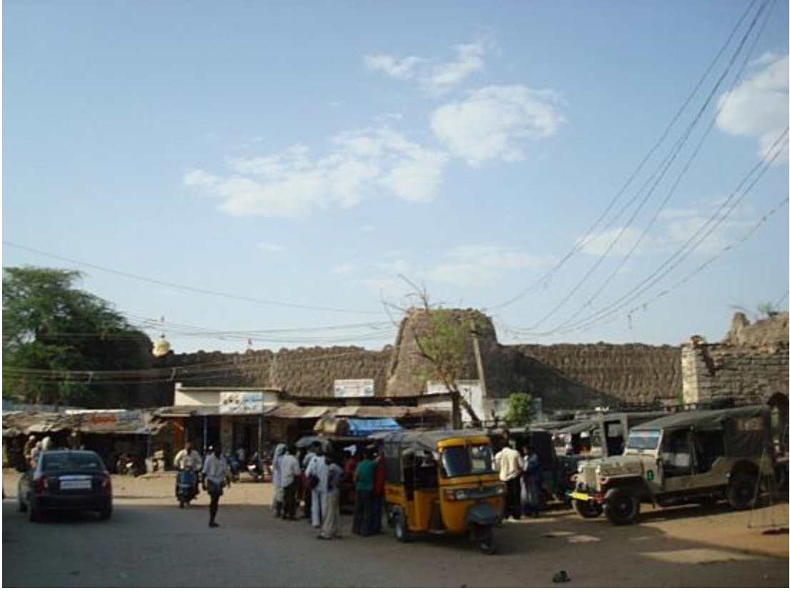
The Fort of Gadwal from Outside