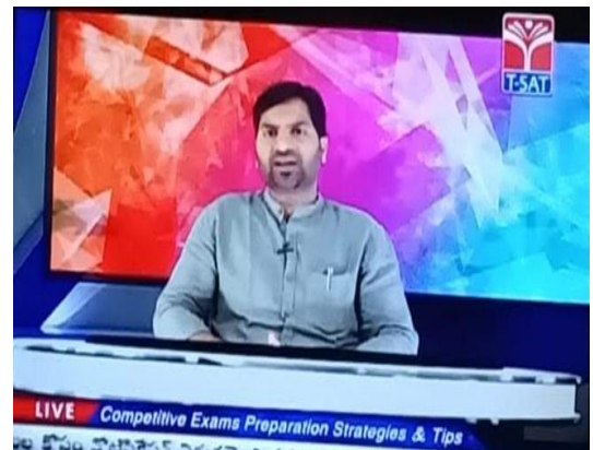
Students watching Live Class on TIPS FOR COMPETITIVE EXAMINATION