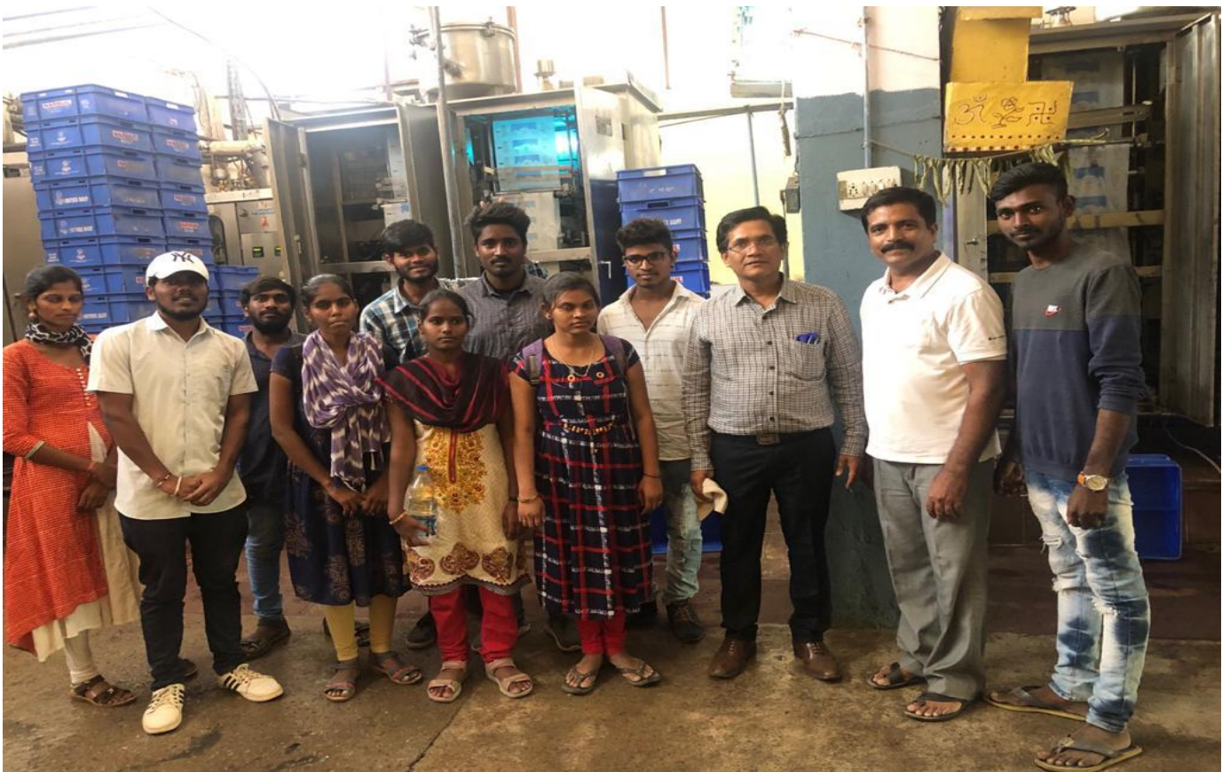
Plate: 4. Packing unit