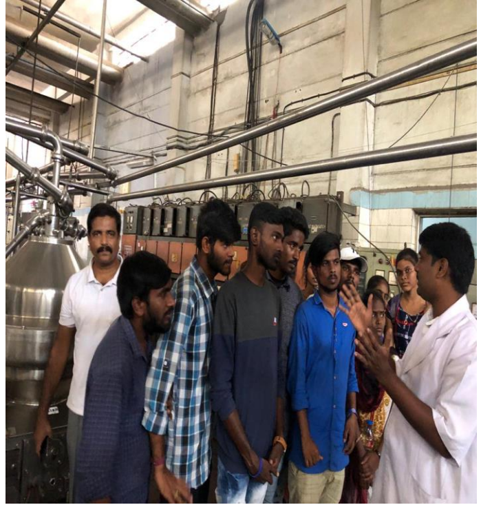
Plate: 2 Students listening to the explanation by Technical Staff at the pasteurization unit