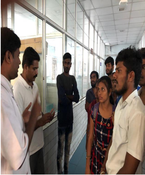
Plate: 1. Students are being explained about the Protocols of the dairy technology.