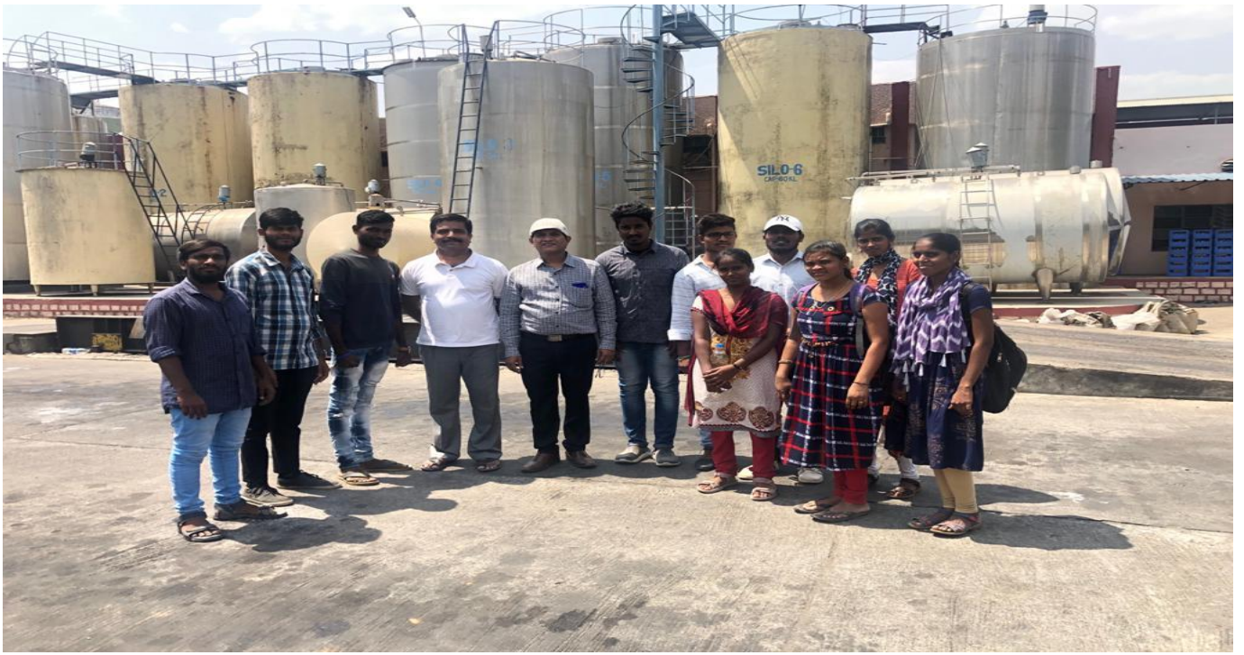
Plate: 3 Milk storage unit