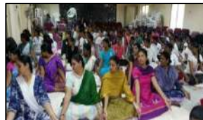
Teaching staff and students take part in Intl Yoga Day

June 21: International Yoga Day celebrated