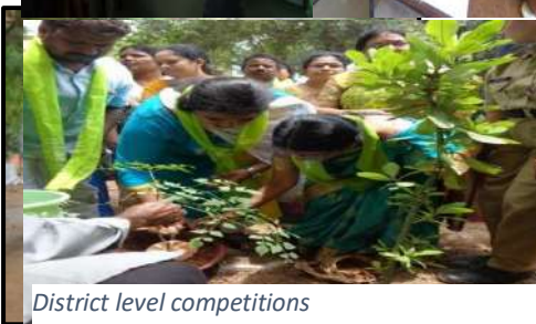
District level competitions