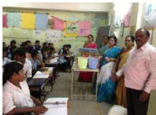
Faculty of Chemistry dept at the Govt School

July 23: The Department of Chemistry organized Poster Presentation competition on Pollution and its effects to B.Sc III year students of GDCW Begumpet.