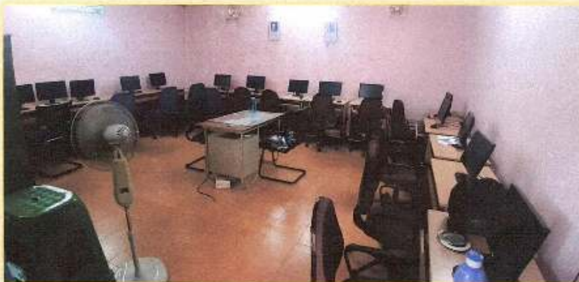
COMPUTER LAB II