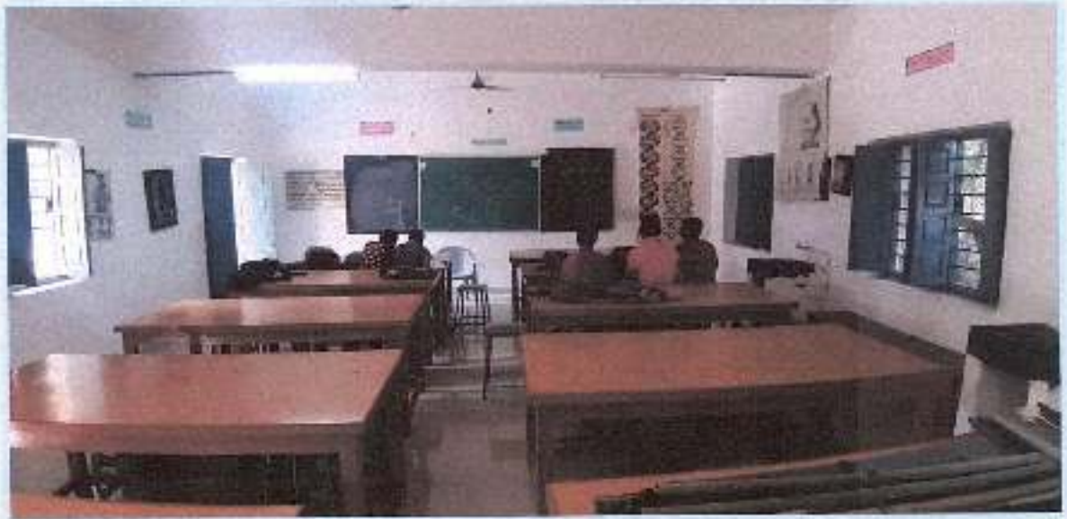
BOTANY LAB I