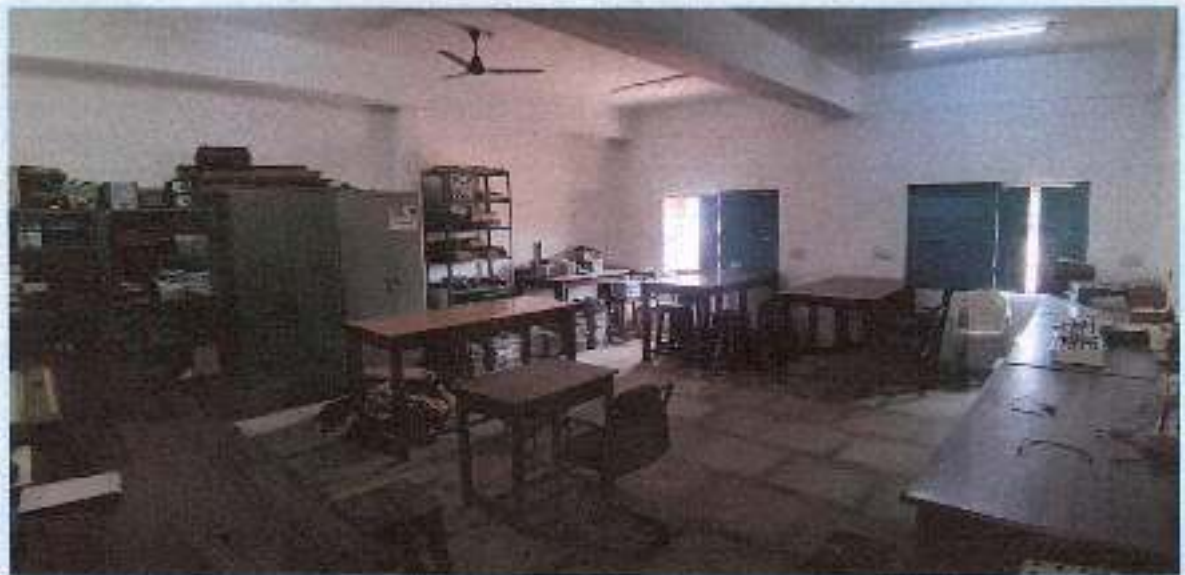
PHYSICS LAB I