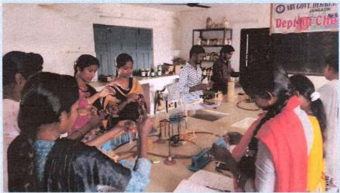
CHEMISTRY LAB II