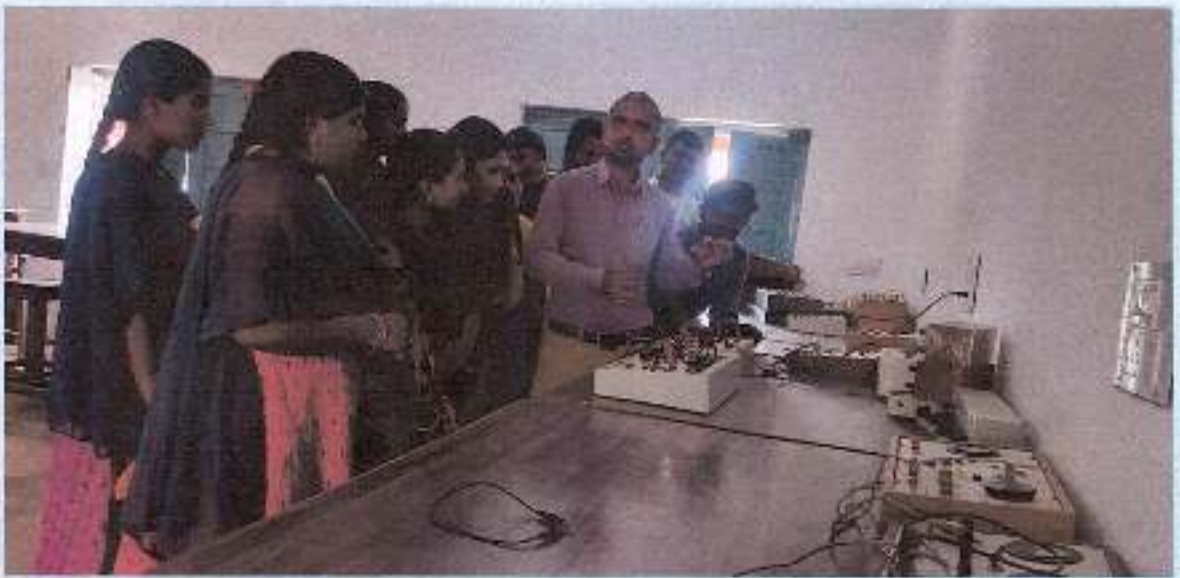
PHYSICS LAB II