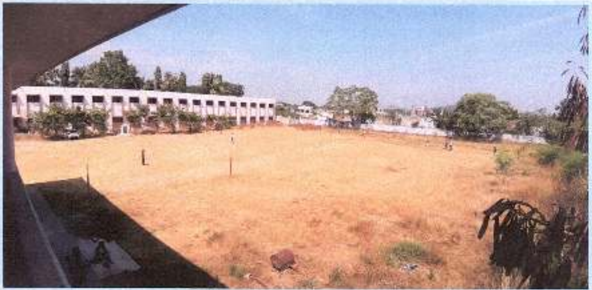
COLLEGE PLAY GROUND