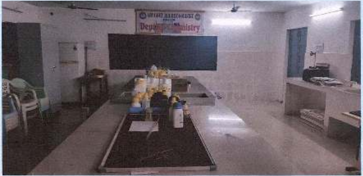
CHEMISTRY LAB I