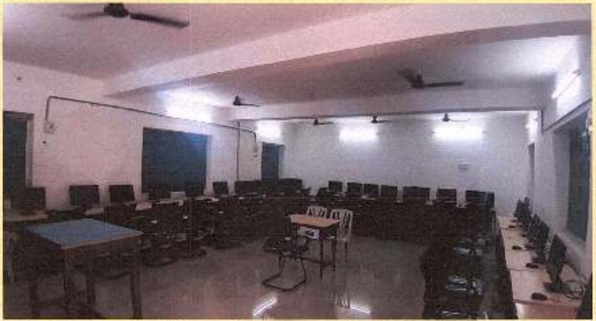
COMPUTER LAB I