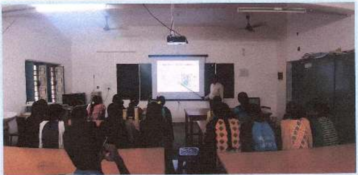
BOTANY LAB II