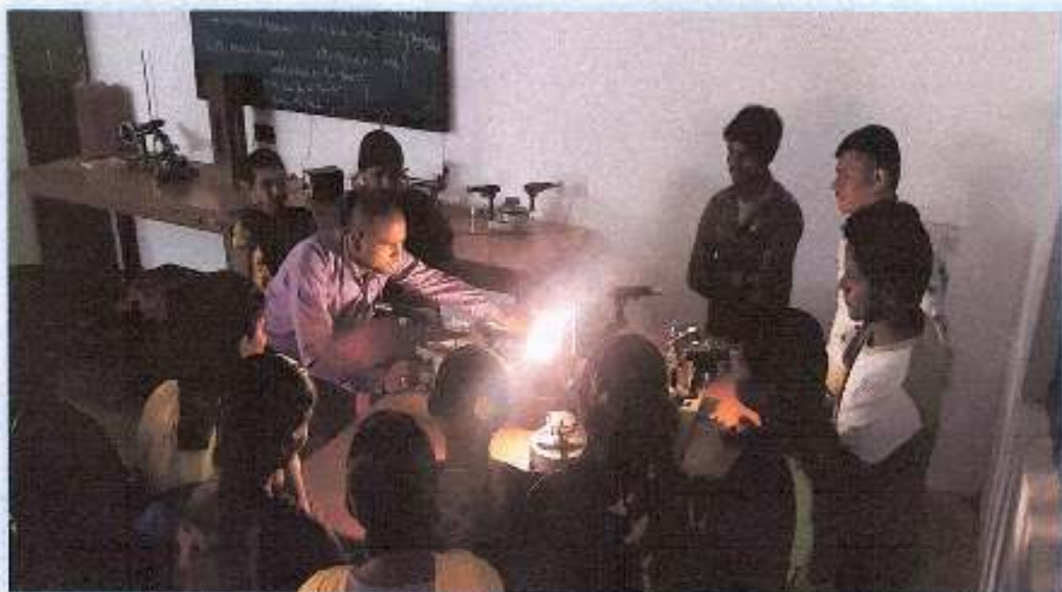
PHYSICS LAB III