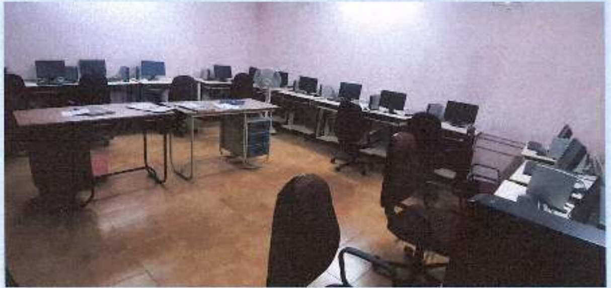
COMPUTER LAB III