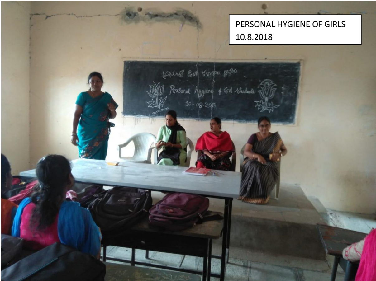
PERSONAL HYGIENE OF GIRLS 10.8.2018