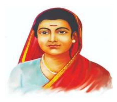
Smt. Savithri bai Phule - Pioneer of Women Education

Hence Women empowerment Cell creates a platform for women and encourages them to participate actively in curricular and co curricular activities along with other gender sensitization programmes specially designed for them.