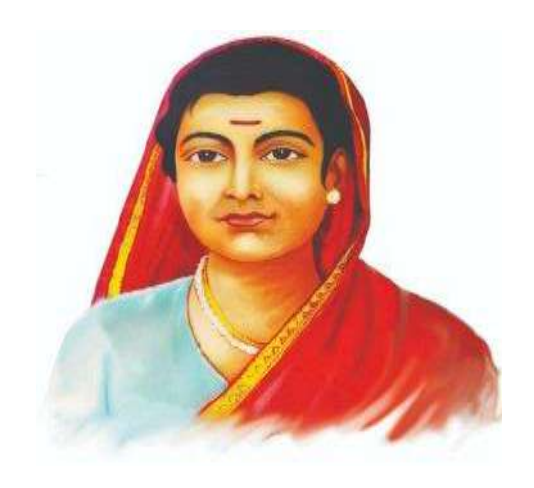
Smt. Savitri bai Phule - Pioneer of Women Education

Hence Women empowerment Cell creates a platform for women and encourages them to participate actively in curricular and co curricular activities along with other gender sensitization programmes specially designed for them.