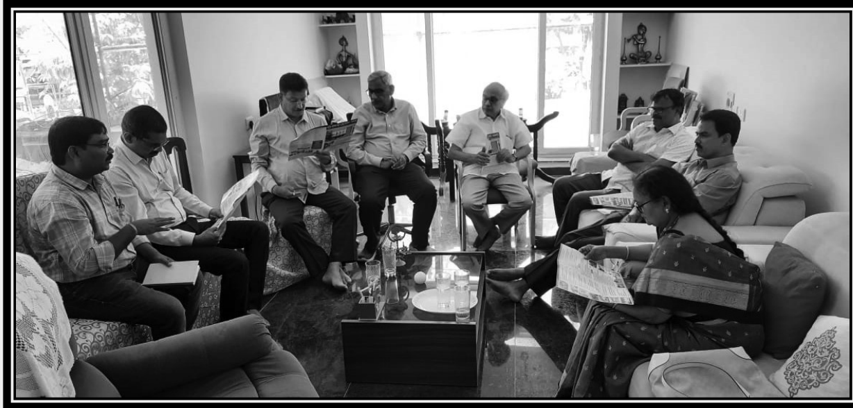
Meeting with Alumni Association for Fund Mobilization