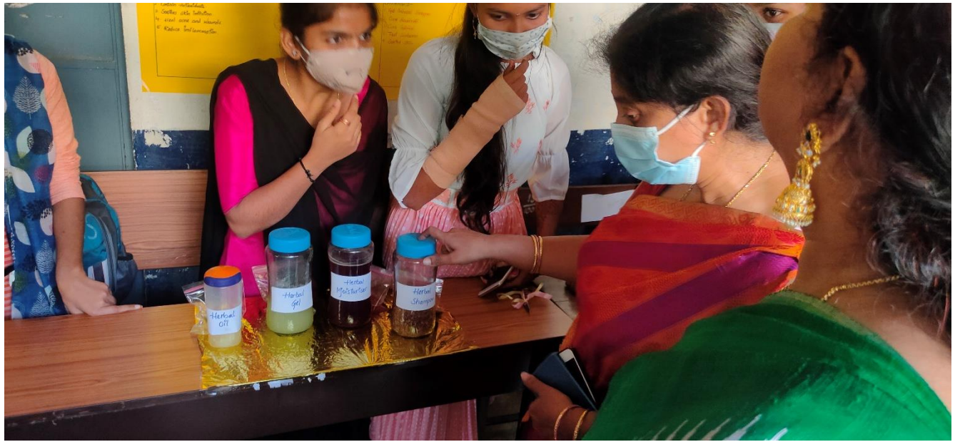
Stalls by Chemistry