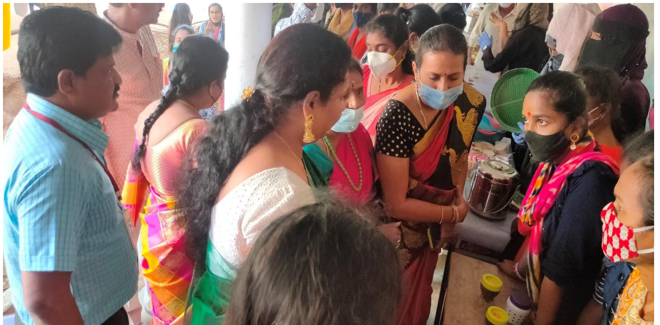
Stalls by Botany