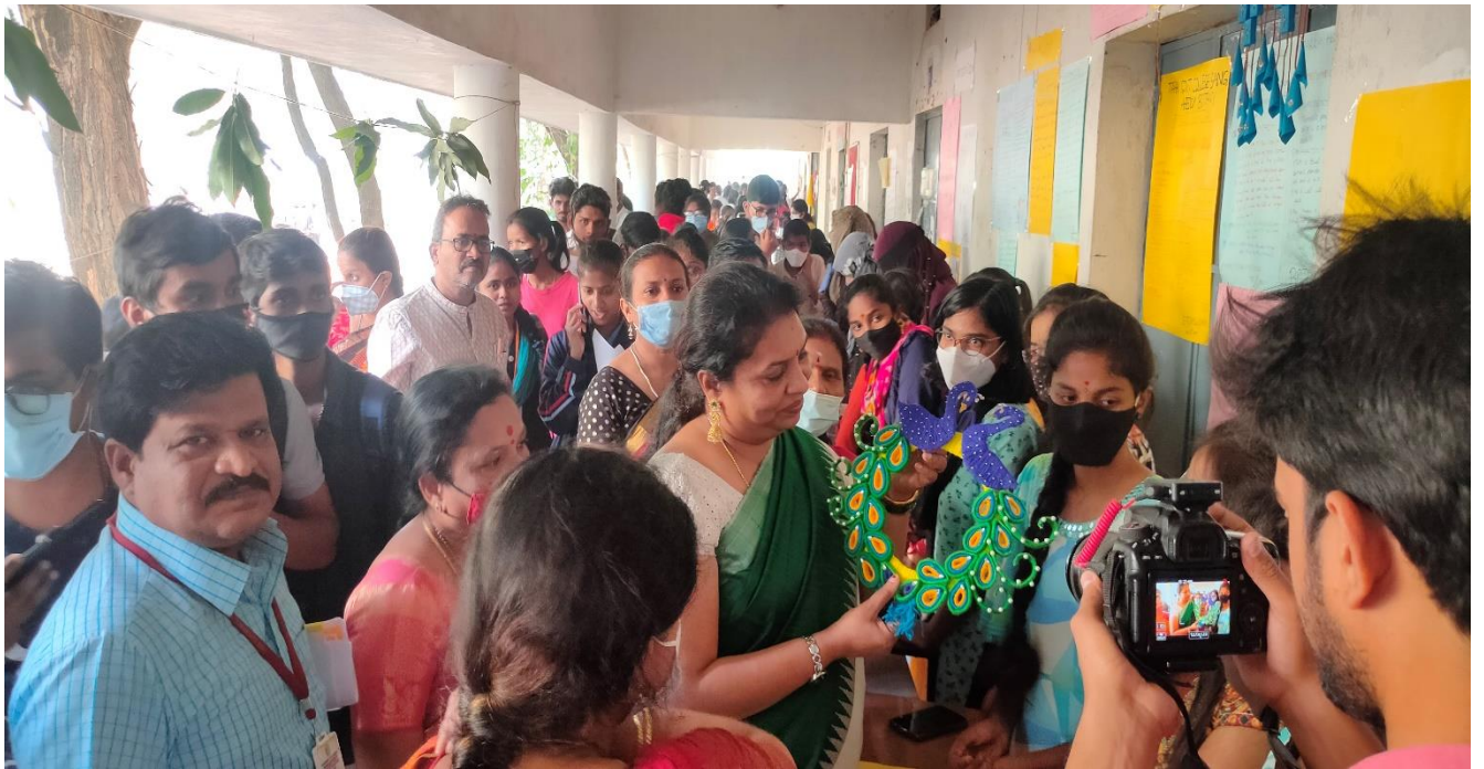
Stalls by Botany