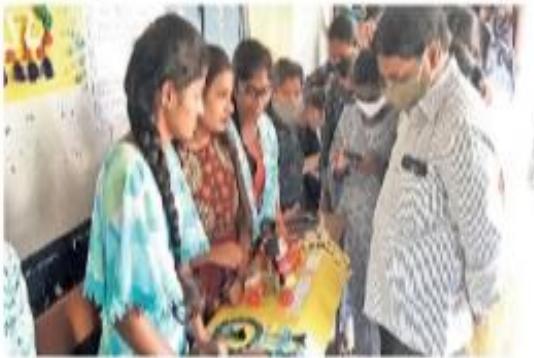
వింగారెడ్డిలో పుణ్యంగా ఆటల వస్తువులను ప్రదర్శిస్తున్న కాలా ప్రభుత్వ డిగ్రీ కళాశాల విద్యార్థులు

వింగారెడ్డి జిల్లాలో, డిసెంబర్ 28: కాలాలో ప్రసిద్ధి చెందిన వంటలు వండింది వాటిని ఎలా తయారుచేస్తారో తెలుసుకోవడానికి ఉద్దేశ్యంగా విద్యార్థులు చేసిన 'మన ఉత్పన్నాలు... మన ఆంగడి'లో విద్యార్థులు సందడి చేశారు. వివిధ రకాల ఉత్పన్నాలను ప్రదర్శించడంతో పాటు అమ్మకాలు చేశారు. రాగి అంబలి, గుమ్మడికాయ తాళి, ముద్దలు, వేరుకర్రలు, మిద్ర వస్తువులు