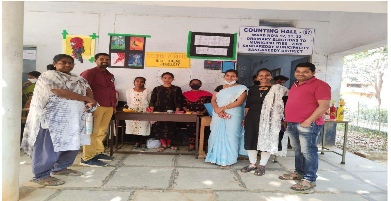
Stalls by the students of Departments of Bio-Technology, Zoology & Computer Science