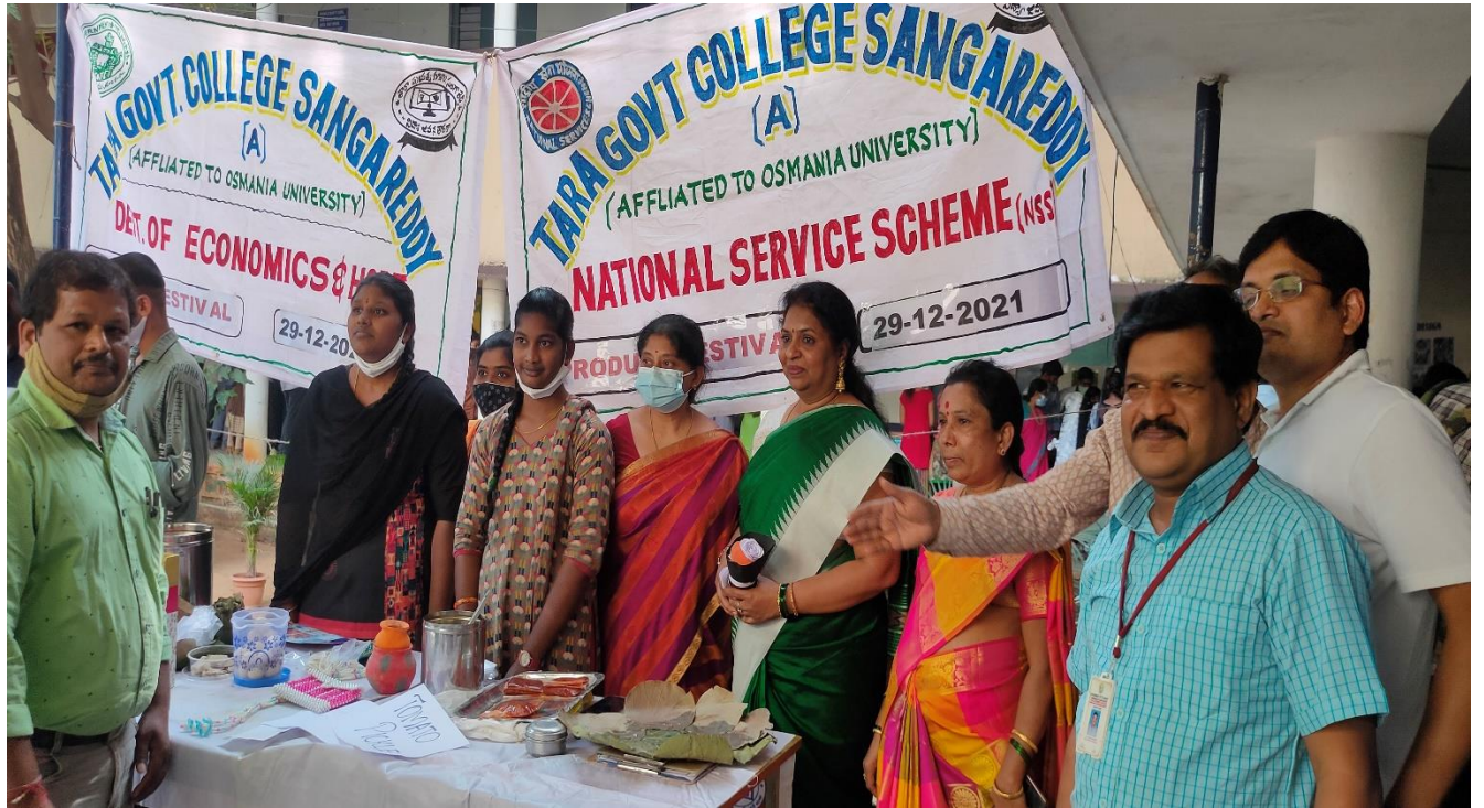
Stalls by NSS Volunteers and Students of Dept. of Economics