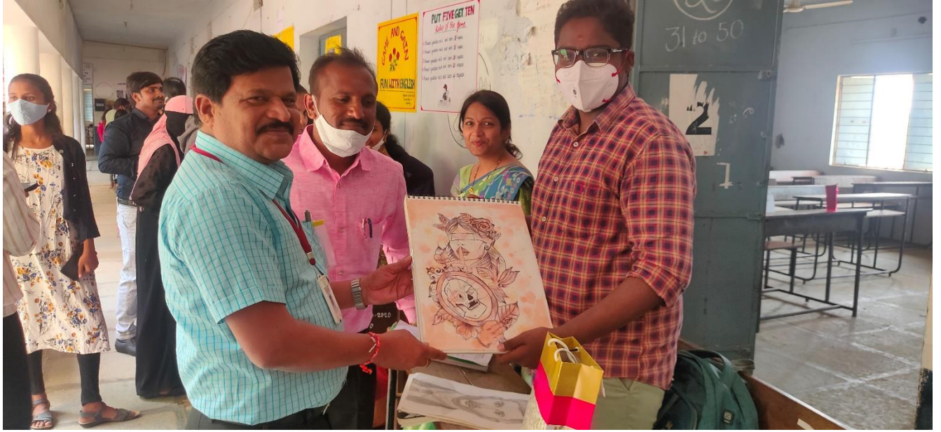
Stall by Department of English