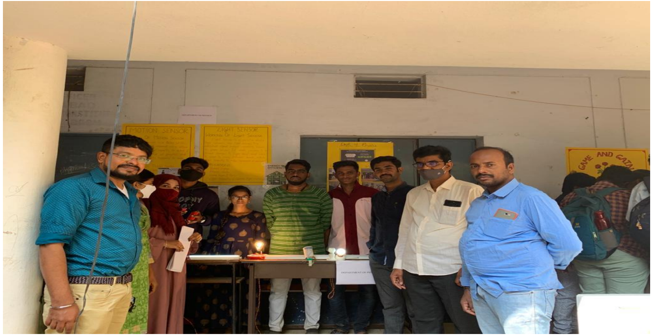
Stall by the students of Dept. of Physics