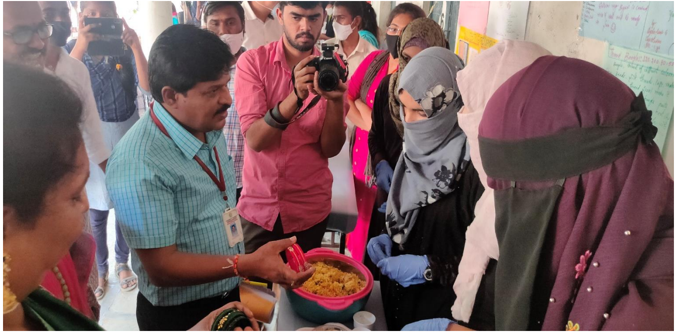
Stalls by Chemistry