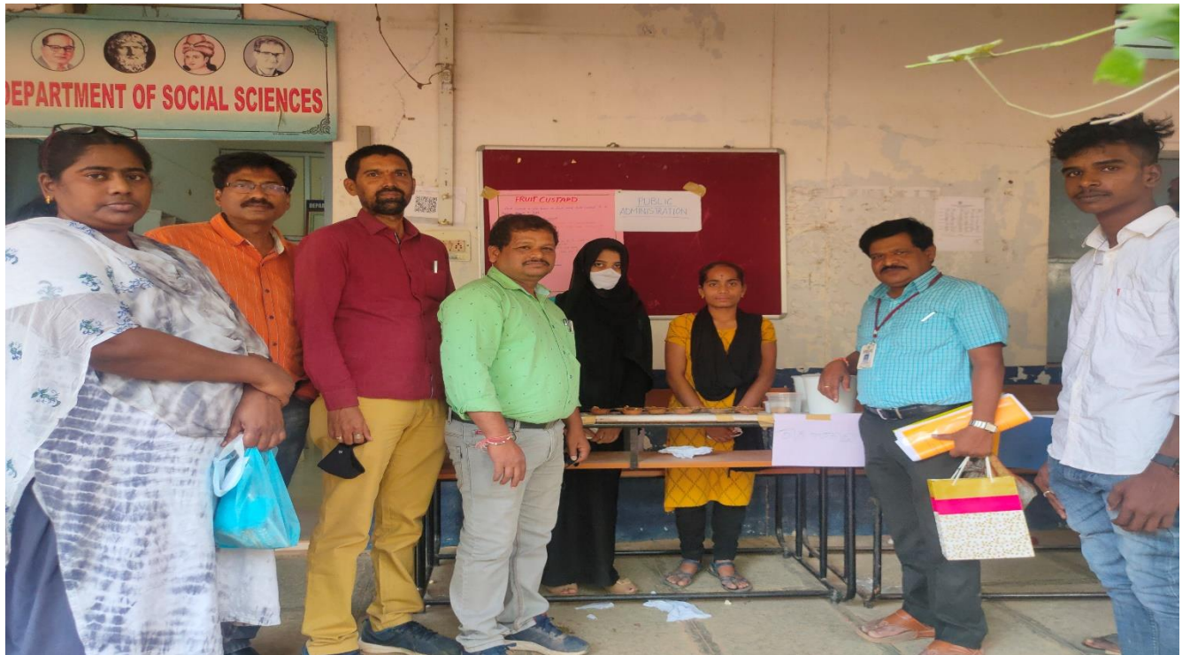
Stalls by the Students of Political Science, Public. Admn. & History