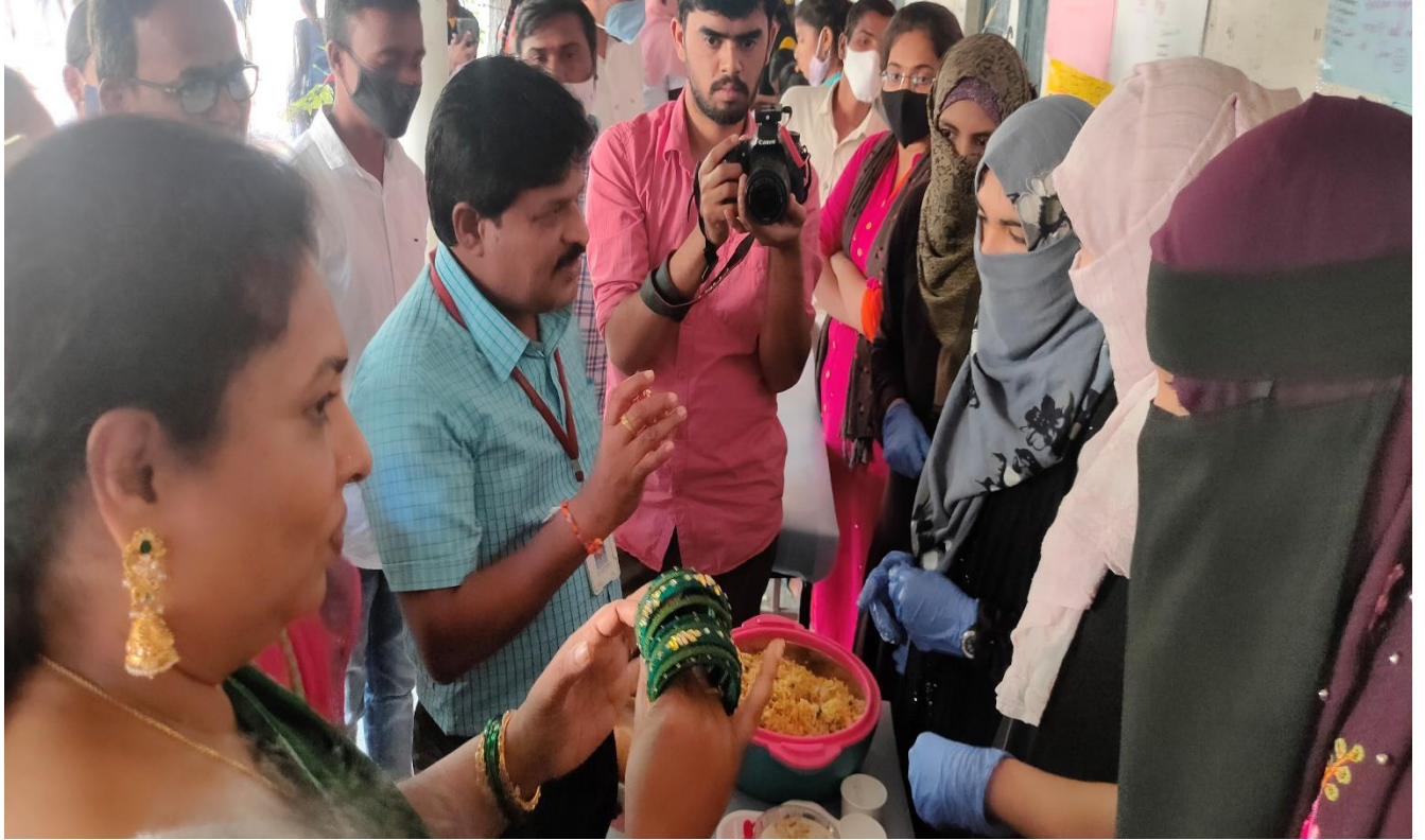
Stalls by Botany