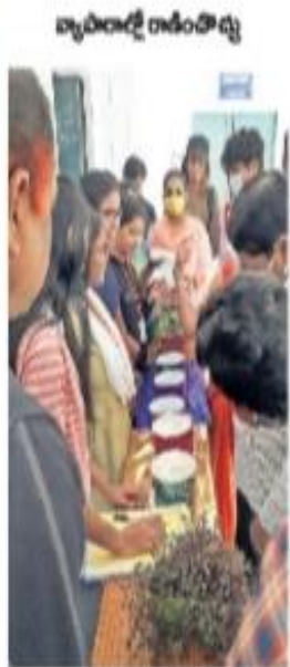
వింగారెడ్డిలోని కాలా కళాశాలలో 'మన ఆంగడి'లో అమ్మకాలు చేస్తున్న విద్యార్థులు

అంగడిలో కనబడే విధంగా, రాగి అంబలి తయారు చేసిన విద్యార్థులు, అంగడిలో ఉన్న వస్తువులను అమ్మకాలు చేశారు. రాగి అంబలి, గుమ్మడికాయ తాళి, ముద్దలు, వేరుకర్రలు, మిద్ర వస్తువులు సందడి చేశారు. వివిధ రకాల ఉత్పన్నాలను ప్రదర్శించడంతో పాటు అమ్మకాలు చేశారు. రాగి అంబలి, గుమ్మడికాయ తాళి, ముద్దలు, వేరుకర్రలు, మిద్ర వస్తువులు