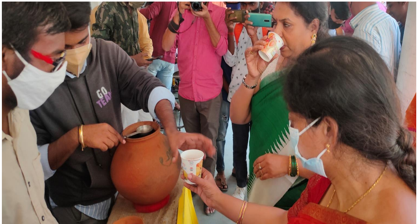
Stalls by Languages- Telugu, Hindi & English