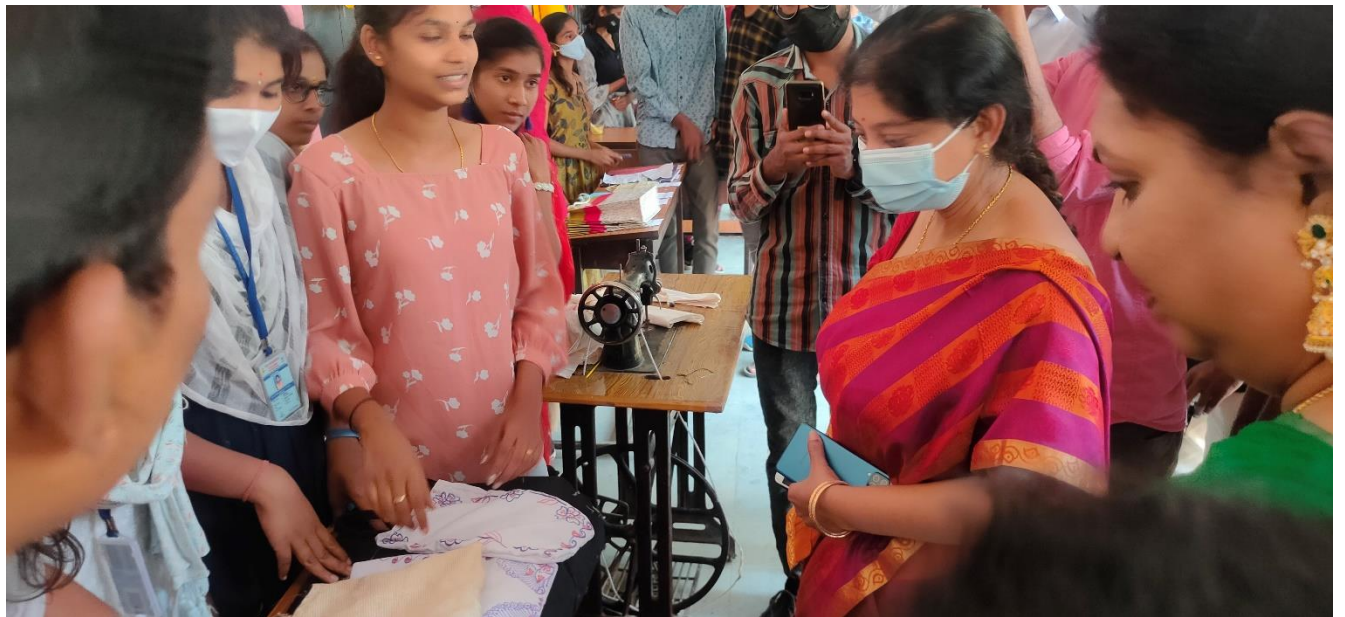
Stalls by Commerce