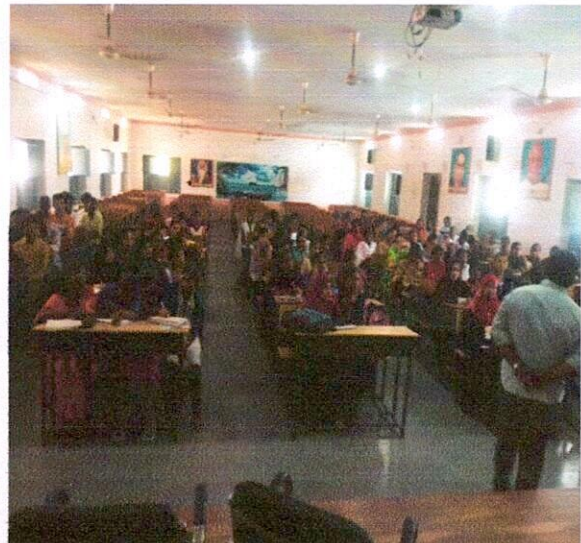
Entrepreneurial Skills Programme on 31-01-2020