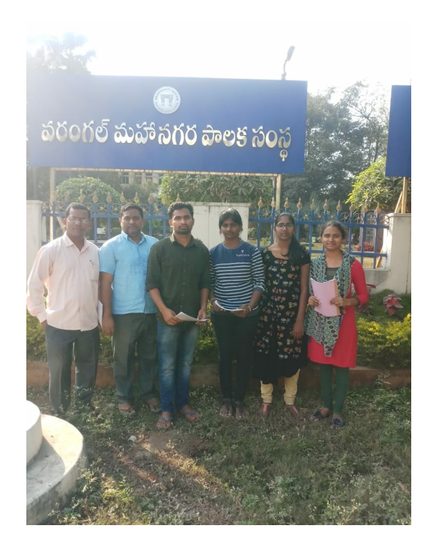
Fig 1: Visit to Greater Warangal Municipal Corporation

March 2013, G.O.Ms.No.99 was issued and merged and inclusion of areas covered in the surrounding forty two (42) Gram Panchayats into the limits of Warangal Municipal Corporation. On 28 Jan 2015, G.O. Ms. No. 40 issued and Declared Greater Warangal Municipal Corporation (GWMC).