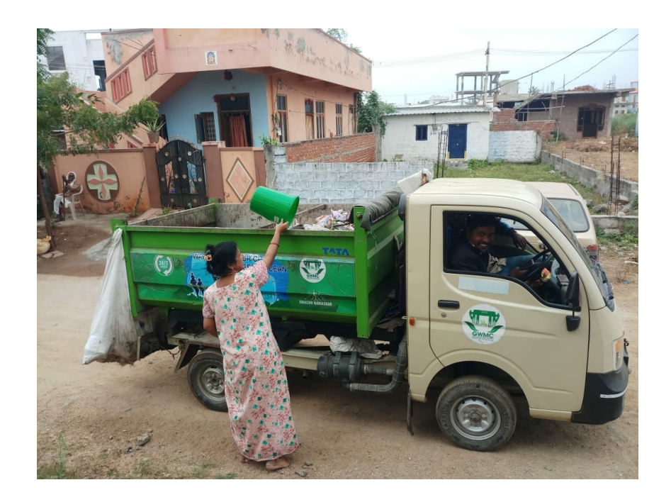
Fig 2: Door to Door collection of Dry and Wet Garbage in Municipal vehicles

The WMC carries out street sweeping on a daily basis. WMC is divided into 20 sanitary circles, for administrative purposes, there are 16 sanitary inspectors and 33 sanitary maistries/safai karmacharis, who are primarily responsible for regular monitoring of sanitation in their respective circles. The Sanitary Inspectors report to Municipal Health Officer, who heads the SWM service in WMC. In addition, 465 workers are deployed by WMC to undertake street sweeping activities and door to door garbage collection.