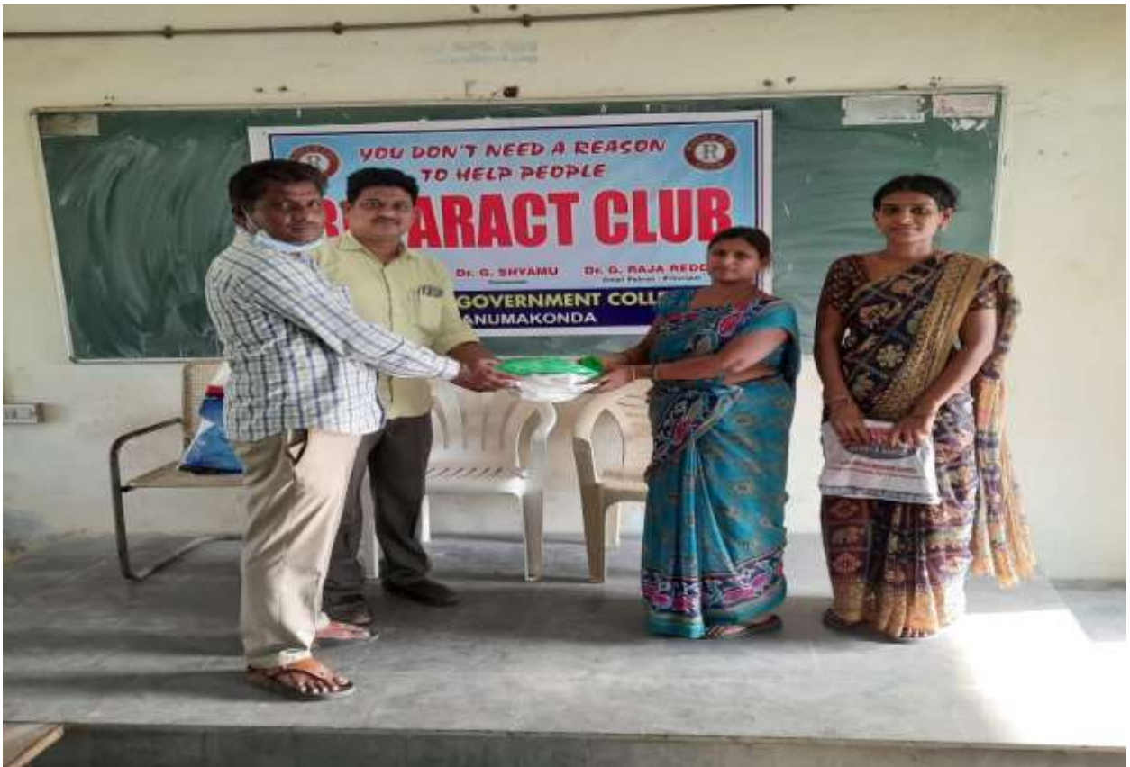
Distribution of Cloths to poor women's on 20/12/2021