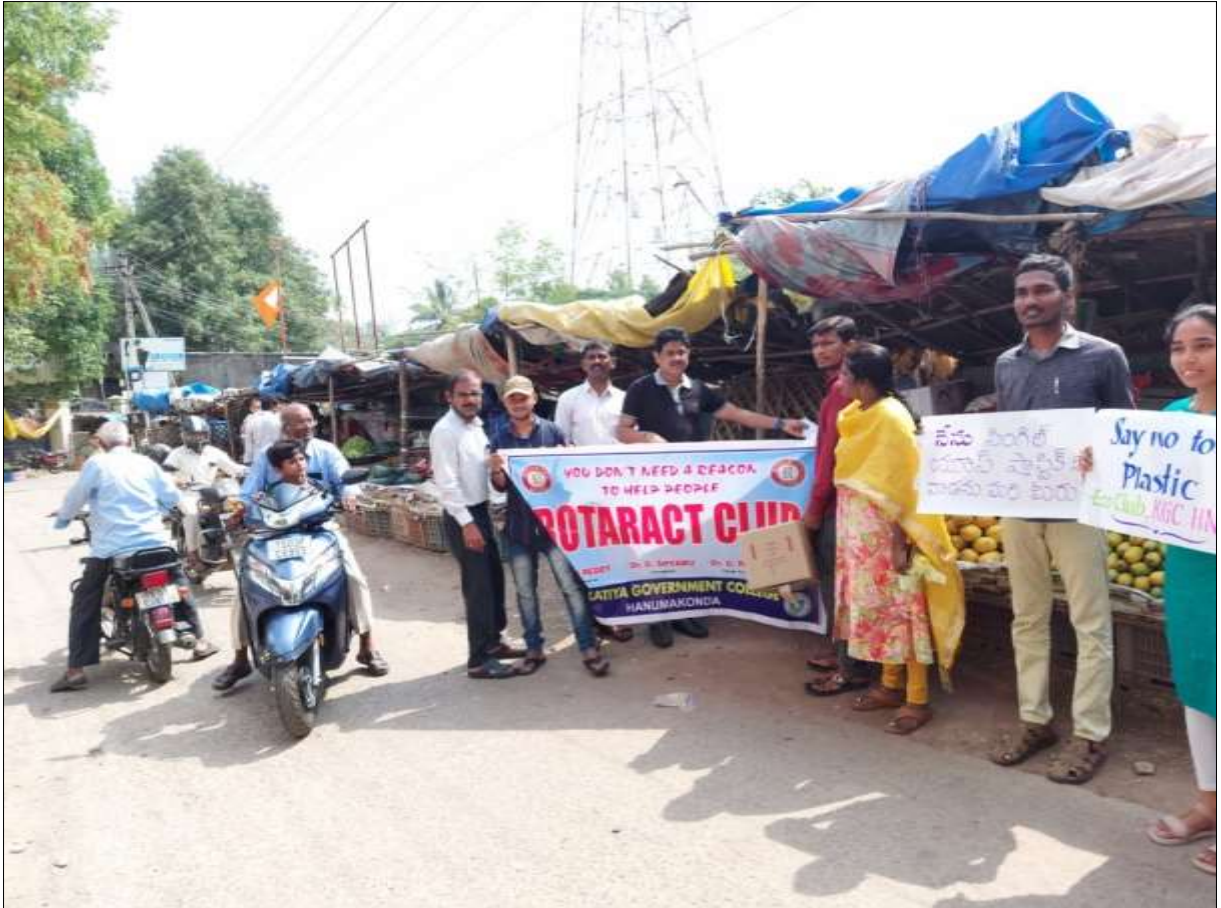
Awareness programme conducted to use jute bag and avoid plastic on