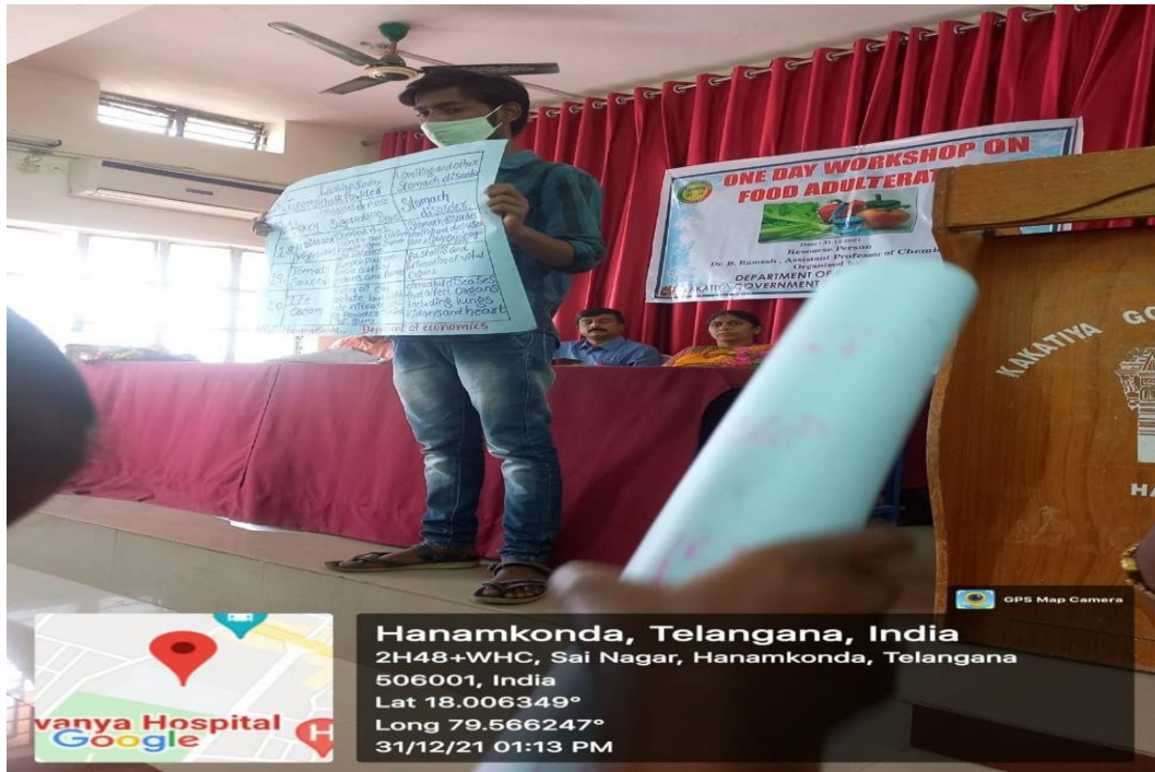
Student's Poster Presentation on Health hazards and Food adulteration