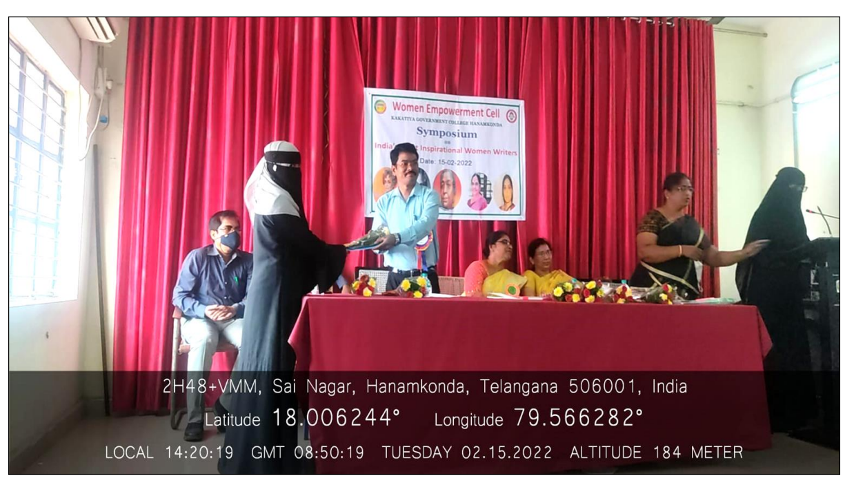
Students receiving the prizes for their presentation in the seminar