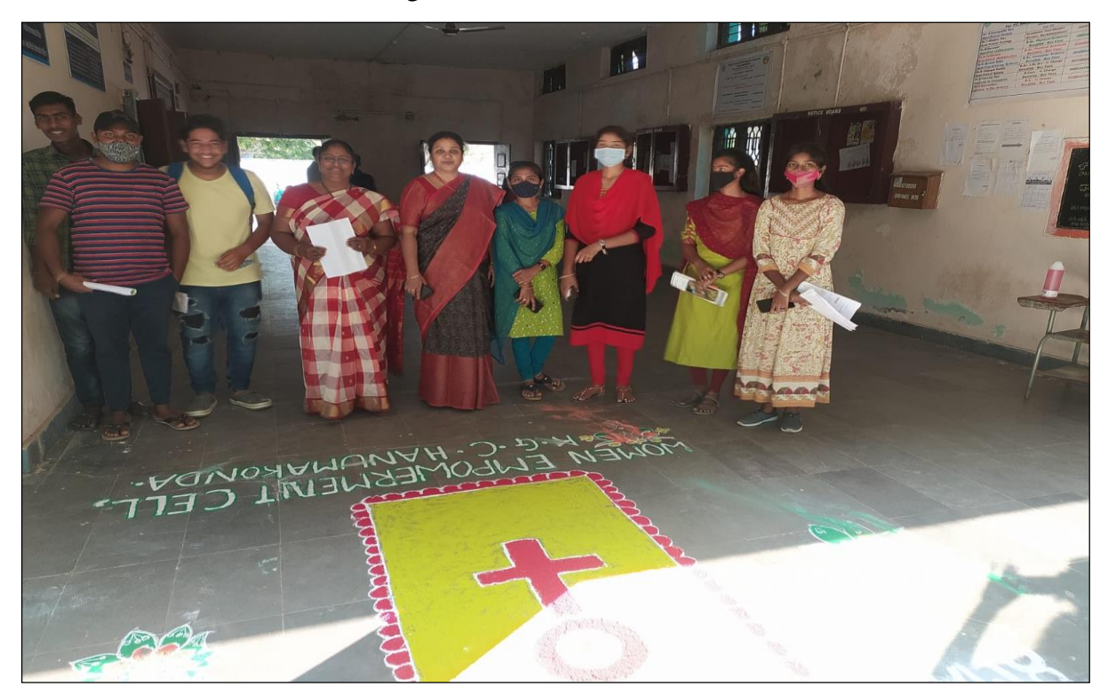
The Students prepared a Rangoli depicting the logo of Gender equality