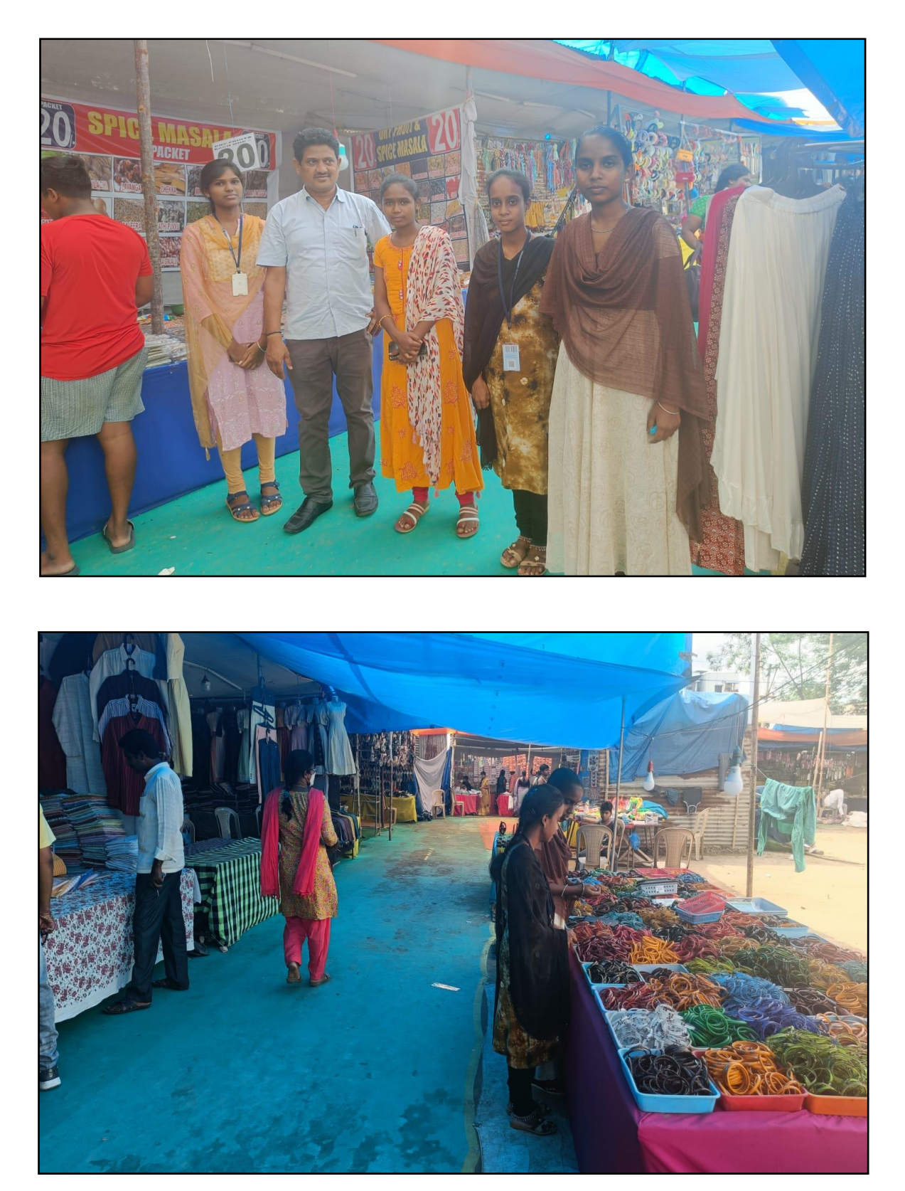
The students observing the products in the bazaar