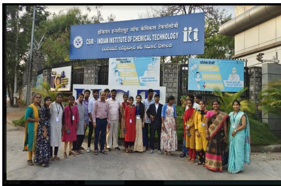
Field visit to IICT, Hyderabad on 30-06-2022