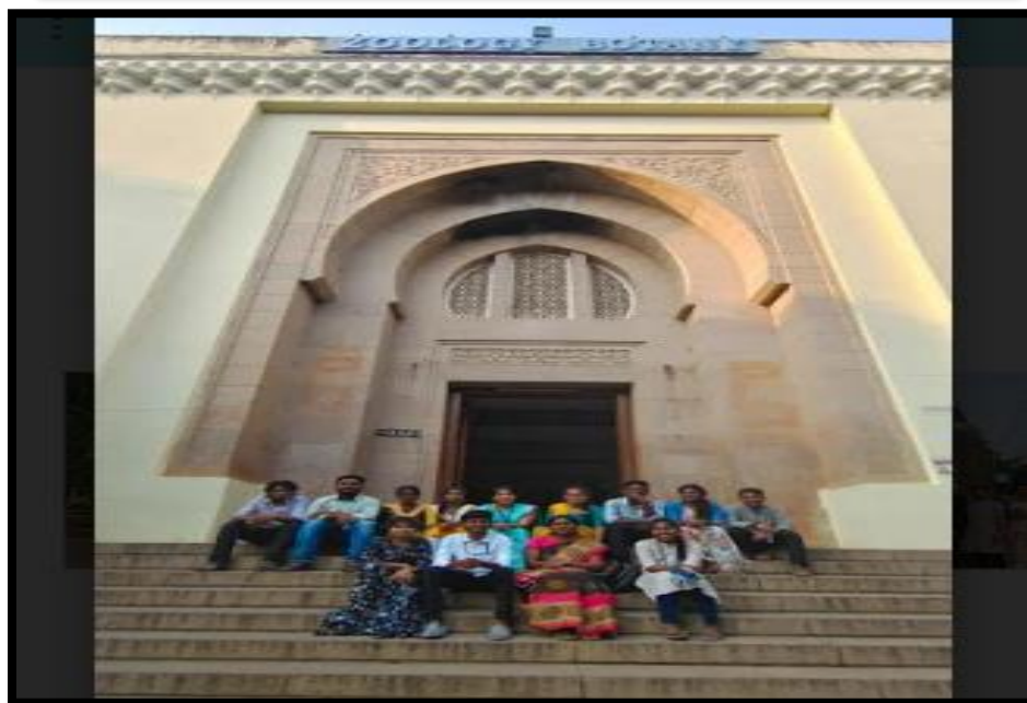
Field visit to osmania University on 30-06-2022,Hyderabad.